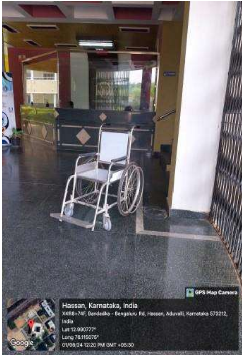
Wheel Chair Assistance