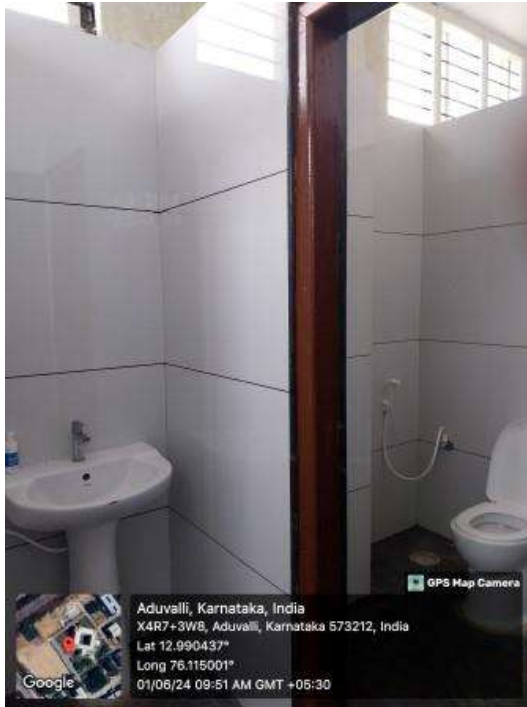
Disabled Friendly washroom

Plot # 1 (D), Growth Centre, Bangalore-Mangalore Bypass Road, HASSAN- 573 201, KARNATAKA (Affiliated to VTU, Belagavi., Approved by AICTE, New Delhi., Recognized by Govt. of Karnataka)