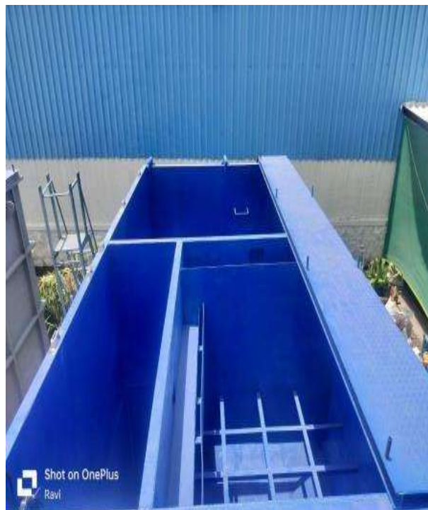
Sewage Treatment Plant