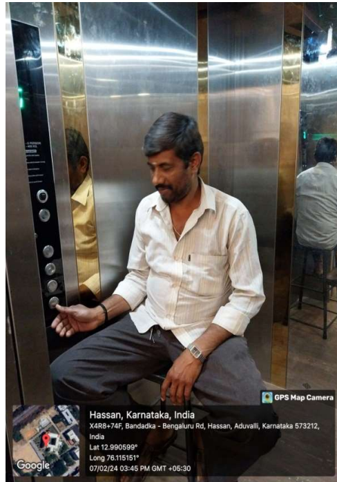
Lift Man Assistance